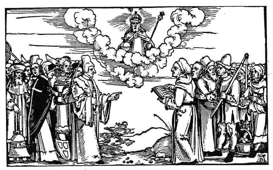
FIGURE 2.2